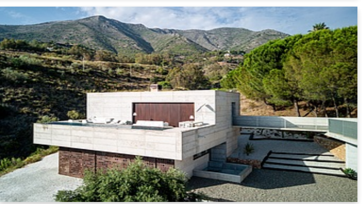
Luxury contemporary villa with minimalist design in the Valtocado Urbanization, Mijas